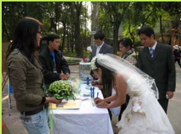
The bride and groom take a moment from their "special day" to sign pledges not to consume bear bile