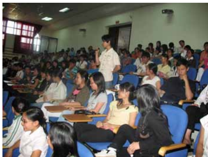
A student in Da Lat poses a question during a university wildlife trade seminar held there. ENV has carried out similar wildlife trade seminars for students at 37 universities around the country since 2007