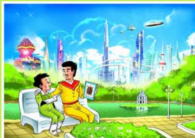
Above: A cartoon in the new Cuc Phuong Visitor Turtle Interpretation Center urges visitor to act now to protect turtles. A father sits with his son near Hoan Kiem Lake in downtown Hanoi sometime in the future and shows him a book about turtles, a strange group of animals that once lived on earth but became extinct due to the negligent and primitive behavior of mankind at the time.