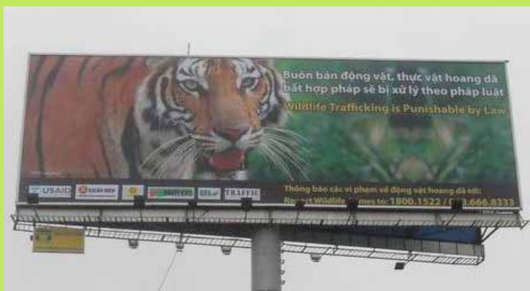
Left: A new billboard along the highway to Noi Bai International Airport warns the public that it is illegal to trade wildlife and violators are subject to punishment under the law. The billboard was developed by TRAFFIC in partnership with the Freeland Foundation.