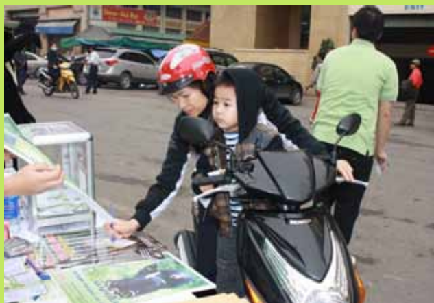
Drive-up pledges accepted! A woman pulls up on her motorbike to sign a pledge not to use bear bile. Since 2008, ENV has collected more than 55,000 signed pledges from residents throughout the country.