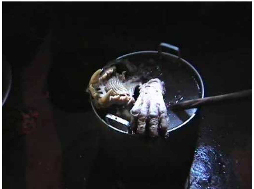
Although smuggling and trade of tigers may be widespread, only a small number of people are suspected of controlling much of the trade into Vietnam

ENV's Wildlife Crime Unit and our field investigations are intended to assist our partners in law enforcement and encourage interest and focus in the pursuit of key figures and their criminal enterprises that are behind the illegal trade of wildlife.