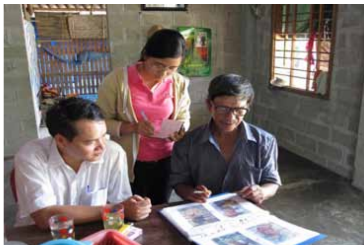
ENV's central Vietnam Wildlife Crime Unit interviewing hunters local residents in communities bordering Phong Dien Nature Reserve about hunting and wildlife trade

The Da Nang team has completed hunting and trade surveys at Bach Ma National Park (field testing of survey methods only), Song Thanh Nature Reserve, Chu Mom Ray National Park, and Phong Dien Nature Reserve. In June, the team will survey Dak Rong Nature Reserve and Kon Ka Kinh National Park in July. Additional urban surveys will be carried out at other major cities in central Vietnam starting in July.