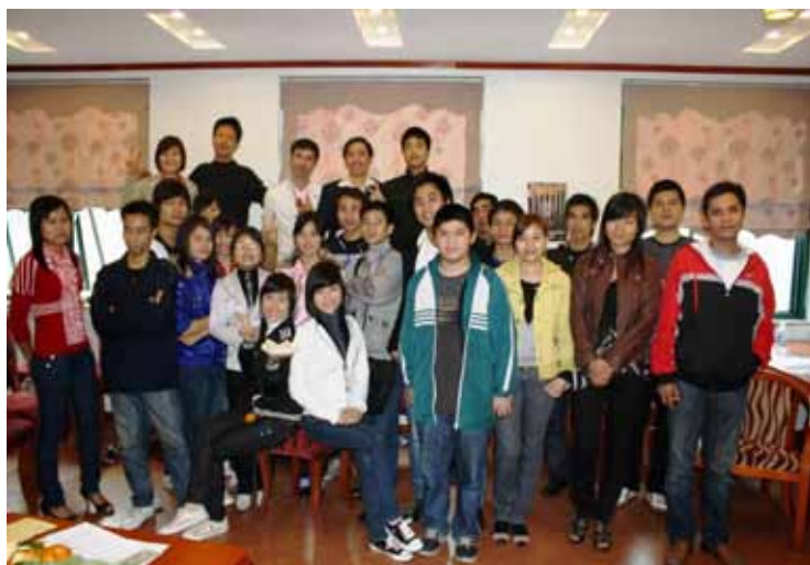
A recruitment meeting in Quang Ninh bolstered the ranks of ENV's volunteers there. Volunteers help with monitoring of business establishments to ensure compliance with wildlife protection laws

ENV has produced five public service announcements over the past few years aimed at encouraging the public not to buy or consumer bear bile. ENV's PSA's air on national television and are also distributed to provincial TV stations and aired locally.