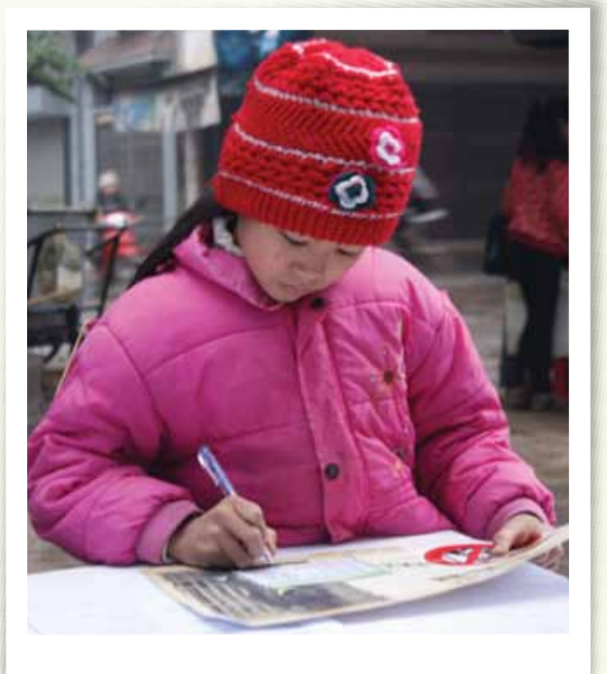
Many children have voiced their opinion on the issue of bear farming in their community. One child wrote, "I feel angry with bear farmers that keep bears for evil purposes like extracting bear bile. To all bear farmers I give this message: Do not hurt these bears for your own benefit. Stop this evil action immediately!"

These hotspot missions are part of a broader campaign to pressure bear farmers and show them that they are the last vestiges of a dying and illegal