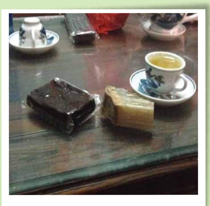
A piece of rhino horn and block of tiger bone TCM at a private home in Hanoi during a March investigation with Environmental Police

The ENV Wildlife Crime Unit is credited with helping bring transparency to wildlife protection efforts at the provincial level, and has provided critical information to law enforcement agencies and decision-makers on trends in the wildlife trade. It has also profiled major transnational smuggling operations involving tigers, rhino horn, and other endangered species of global importance.