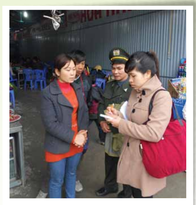
ENV monitoring staff and a forest ranger from My Duc district confront a restaurant owner over a violation during joint inspections of restaurants operating outside of Huong Pagoda

claimed otherwise, telling undercover ENV teams that the animals they hung in front of their shops were, in fact, from the wild.