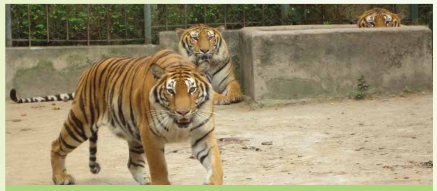
Tigers at one of Vietnam's nine private farms and zoos. Growth of tiger farming in Vietnam has been largely arrested, but farmers continue to push to open the legal trade. ENV conducts regular monitoring of farms to verify compliance with regulations and report violations