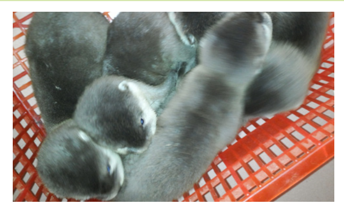
Five otters were offered for sale on the internet in March and subsequent actions by ENV in cooperation with police resulted in their seizure and transfer to a rescue center