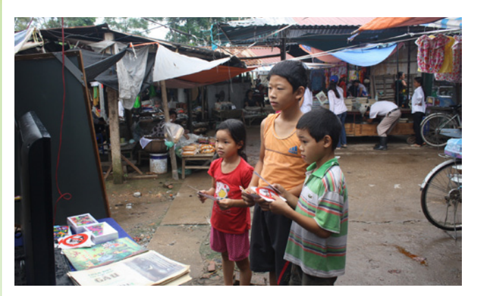
Kids watch in silence a short film showing a bear bile extraction that was filmed within their community