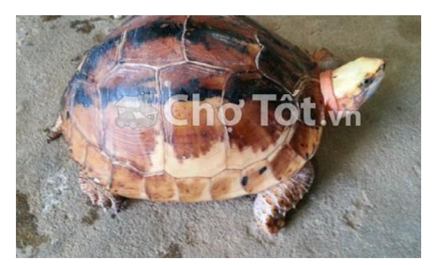
This critically endangered Bourett's box turtle is endemic to Vietnam and was confiscated following a "sting" operation in cooperating with police

In addition to addressing remaining violations from the November survey, ENV will conduct a second phase of the campaign in May to keep the pressure on website administrators and identify and target new advertisements that have been placed since the initial survey in November.