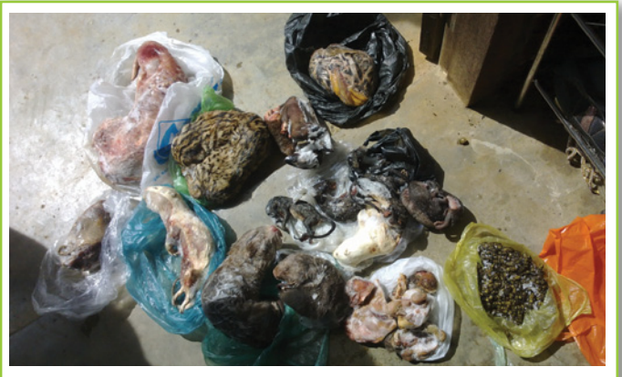
Animal parts and meat seized by Lam Dong authorities during the three-month long campaign

Violations were discovered in 18 establishments, resulting in confiscation of 61 live animals including lorises, leopard cats, macaques, civets, and monitor lizards, and a quantity of wildlife meat. ENV participated as an observer during inspections in only three districts.