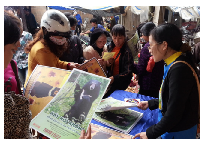
A market event in the heart of a bear farming community draws interest from the public

Since the program began in 2012, ENV has sent more than 20,000 letters to bear farmers and made 4,568 telephone calls. Regular radio advertising, such as