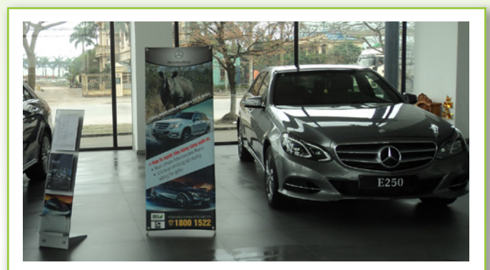
ENV has formed partnerships with luxury car dealers including Mercedes, BMW, and MG as part of a developing campaign to reach rhino horn consumers and would be consumers

In another attempt to expand outreach activities targeting the consumption of bear related products, during the first three months of 2014 ENV's Wildlife Protection Clubs in Hai Phong city, Hanoi, Vinh City of Nghe An, and in Binh Duong province hosted a total of seven "End Bear Farming and Trade" events in parks and at universities. Linked to the development of "ENV outposts" the volunteer clubs received training, materials, and support from ENV to host the events.