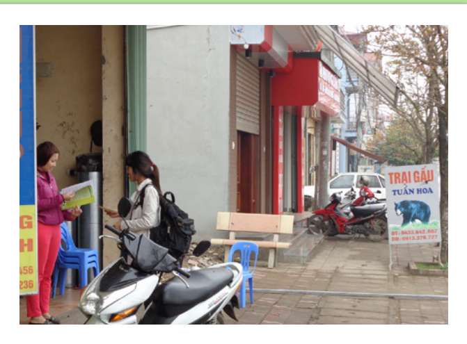
ENV staff visit neighbors of bear farmers as a means of increasing pressure; in the background is a sign advertising a bear farm

the new Uyen Linh commercial, PSAs on TV, growing support from celebrities and the public, particularly younger people, and seemingly never-ending noise in the media may be finally taking its toll on bear farmers. ENV has also focused targeted campaigns on two bear farm hotspots, Quynh Luu district in Nghe An province and Phuc Tho district in Hanoi, where large numbers of bears and bear farms are concentrated. "Hotspot" missions involve programs carried out in bear farm communities including market campaigns, farm visits and inspections, bear bile sign removal campaigns, use of the community public address system, programs in schools, and visits to neighbors of bear farmers. All of these activities are intended to place additional pressure on bear farmers and make it increasingly difficult for them to carry on with their business.