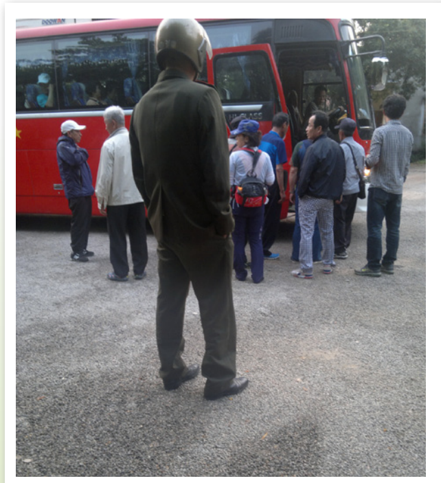
A member of the Task Force looks on as a group of Korean tourists are required to re-board a bus that has stopped at one of the Ha Long Bear farms. During the first few weeks of task force operations, buses were turned away. Since then, there have been no buses recorded

On March 19, the Task Force initiated surveillance and inspections, with two teams on the ground for seven days a week. During the first week, three buses full of Korean tourists were prevented from entering farms and turned back. Inspection teams entered the farms