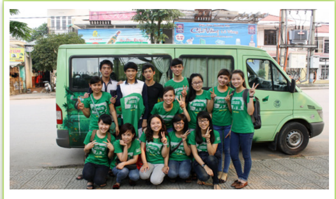
The ENV mobile outreach team and the new Quang Tri Outpost on mission in the province of Quang Tri in March