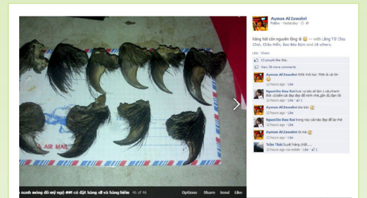
Bear claws advertised for sale on the internet are fairly common. The campaign has resulted in a 93% reduction in bear product advertisements with 235 advertisements removed

The campaign also has involved some gritty action targeting some of the more serious advertisements. For example one advertisement led to the confiscation of five live otters in Ho Chi Minh City after the WCU, ENV's HCMC team and the HCMC police set up a sting operation to catch the perpetrators.