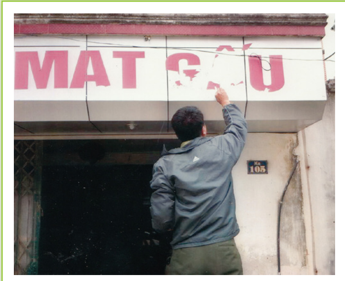
Authorities paint over a sign advertising bear bile as part of a campaign by ENV and local Forest Rangers to remove illegal advertisements

Three lucky leopard cats in Dong Thap province seized from traders after a concerned citizen contacted ENV's Wildlife Crime Hotline