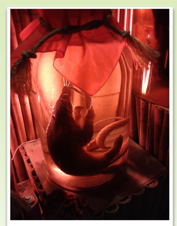
Pangolin in wine in a Hanoi restaurant

While the results of the campaign indicate a 42% reduction in consumer crime in the eight districts that were targeted, the performance between Hanoi and HCMC differed widely; Hanoi achieved a 39%