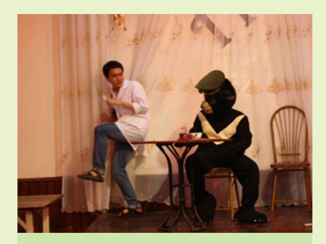
Medical students performing the "Especially for Bears" skit during a wildlife trade seminar at their college in Hanoi