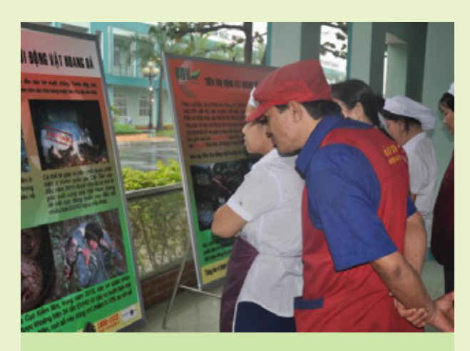
Staff of 29.3 (textile) Company learning about wildlife protection during an exhibit held at their factory in December

A new wildlife trade exhibit is reaching thousands of potential wildlife consumers each month encouraging the public not to consume wildlife and to report wildlife crimes. ENV teams in all three regions (north, central and south) of the country host the event in public parks, major shopping malls, markets, and at universities. Each event includes a series of